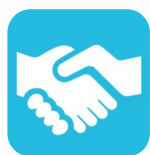
Trust & Confidentiality