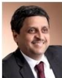
Founder and MD CATS Academy

CATS Academy India exemplifies its position as a premium business solutions provider in management consulting and leadership development . We endeavor to make positive difference to individuals and organizations through transparent and collaborative working style. We have a pool of specialized industry experts to provide you with end to end business solutions.